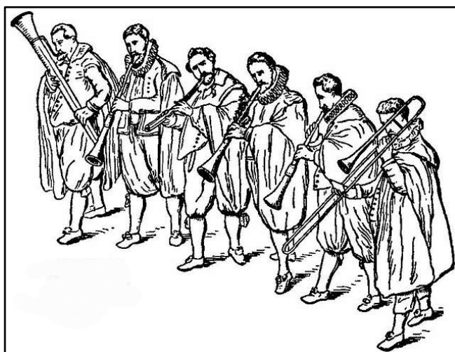
Drawing based on a painting by Denis van Alsloot (c.1570–c.1626) depicting five musicians in a procession. Pictured from L to R are a bass dulcian, a shawm, a cornetto, two more shawms, and a sackbut

The dulcian is the predecessor of the bassoon, with an exposed double reed and a conical bore that doubles back onto itself. It was carved from a single piece of wood, rather than in separate sections like the bassoon. It was known by other names—curtal (English), douçaine (French), and bajón (Spanish) being the most common—and was used from at least c.1550 until around 1700. It was used in both secular and sacred music and its flexible dynamic capabilities enabled it to play either in outdoor settings, usually in a wind band, or in more intimate chamber music performances.