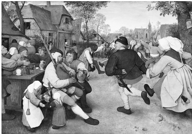
"Peasant Dance," painted in 1568 by Pieter Breugel the Elder

Our season will open with a lighthearted program about the ways in which people spent their leisure time in the Middle Ages and Renaissance, and how they sometimes got into trouble in the process.